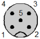
Figure 7: Contact configuration M12 plug